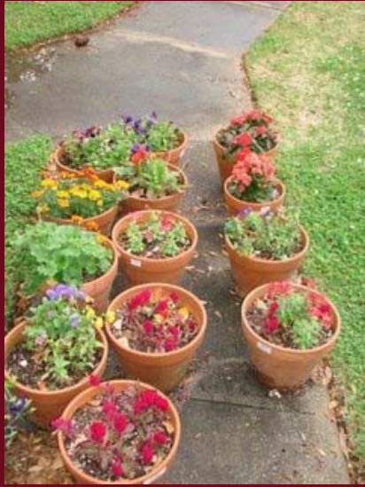
More Stolen Flowers!